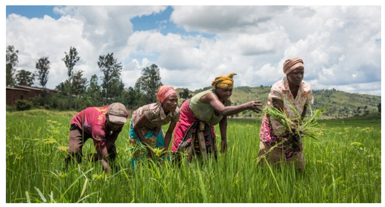
Farmer training in Rwanda